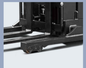
The structure of rotary load wheel offers the truck better passing ability