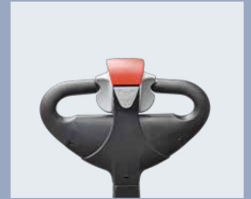
The unique lighted creep speed driving function allows the truck to move at slow speed more conveniently