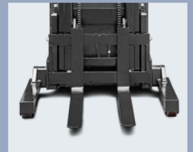
Distance between wheel arms: 38.2"