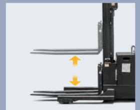
Standard configuration of lifting and lowering stepless speed regulation realizes more accurate operation of the fork