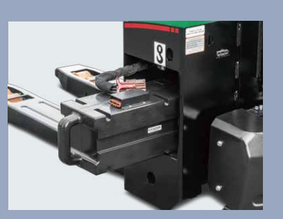
asy for exchanging battery