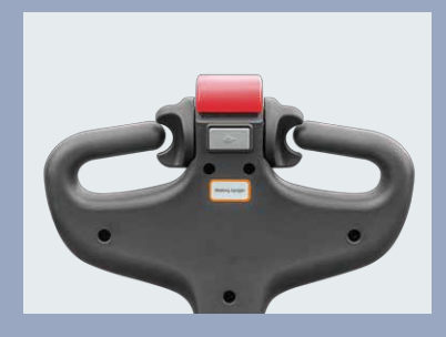
The upright-tiller running function allows it to work within confined space, such as container