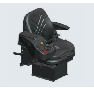
Suspended seat with fingertip system that can be easily adjusted to suit each customer.