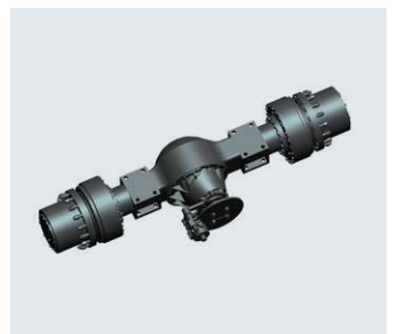
Heavy-duty traction axle, two-stage deceleration; Wet brake, maintenancefree; Hydraulic release spring action parking brake, safe and reliable.