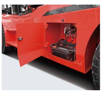
Battery compartment is easy to open for easy maintenance.