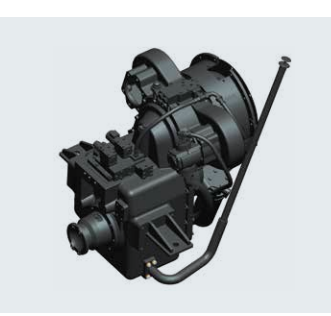
OKAMURA gear box with microelectronic control provides for twoshift power shifting, travelling is stable and accurate.