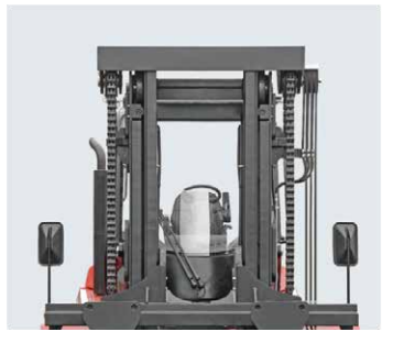
Excellent all round visibility is achieved by the overall design.

Thanks to the unique design, cab can be tilt without any tools, major service items can be reached easily by tilting the cabin, maximized access is possible.