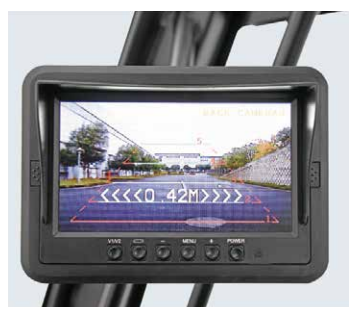
Optional imaging system with front and rear camera, increasing the safety greatly.